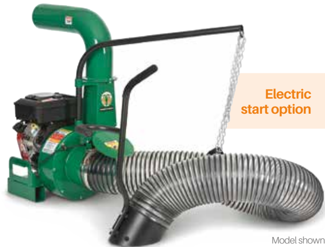
Model shown: DL1801VE with electric start

The 20 cm intake hose is a 300 cm long, best in class, clear poly helical coil.