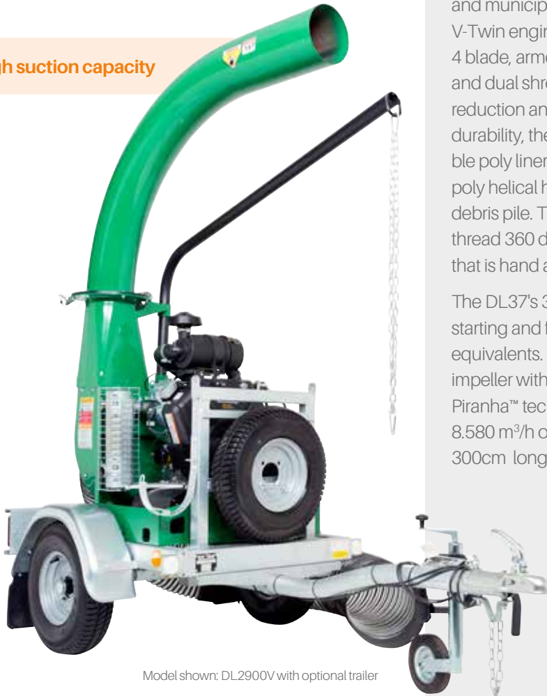
Model shown: DL2900V with optional trailer