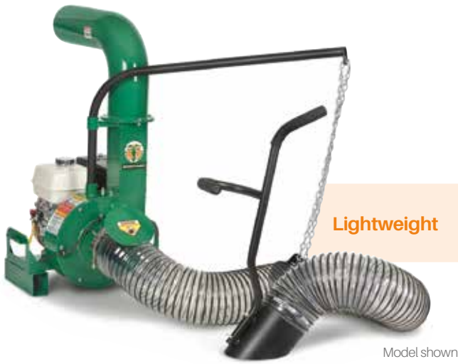
Model shown: DL1301HEU