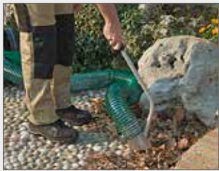
LB Hose Kit 10cm x 210cm (900460)