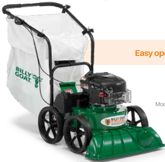
Model shown: KV601SP