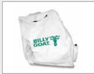
LB Turf Bag Turf bag for Little Billy. 105 litre capacity. (900722)