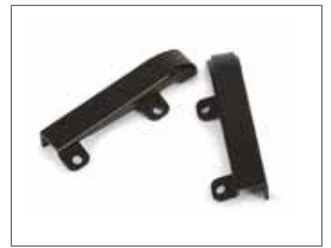
Nozzle Wear Kit Prevents nozzle wear on hard surface applications. (891127)