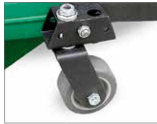
Caster Wheel Kit Increases manoeuvrability. (891128)